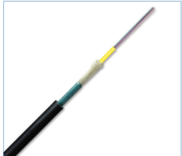
Part Number: 008EEY-13122H2G